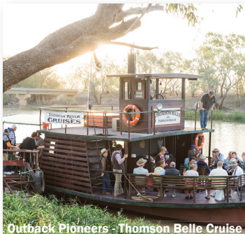
Outback Pioneers - Thomson Belle Cruise