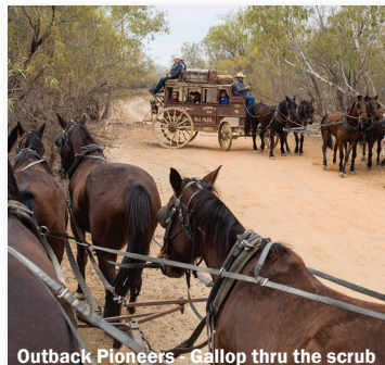
Outback Pioneers - Gallop thru the scrub