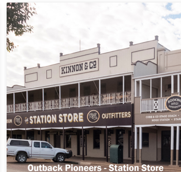
Outback Pioneers - Station Store